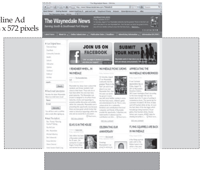
Banner 798 x 80 pixels