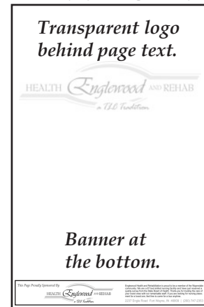
Reduced Size (Actual Size 10.5"x1.5")